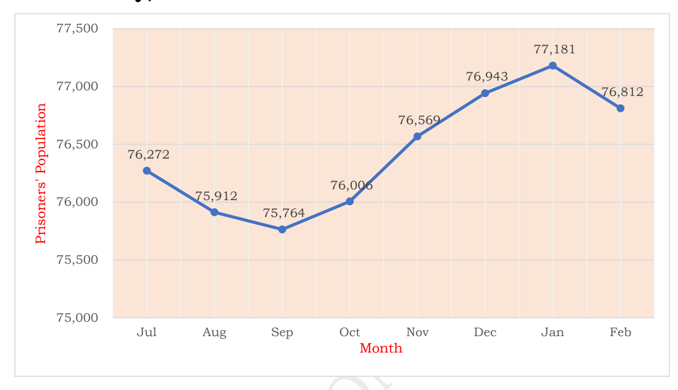
Figure 2: Trend of prisoners' population growth for the period between July, 2023 and February, 2024.