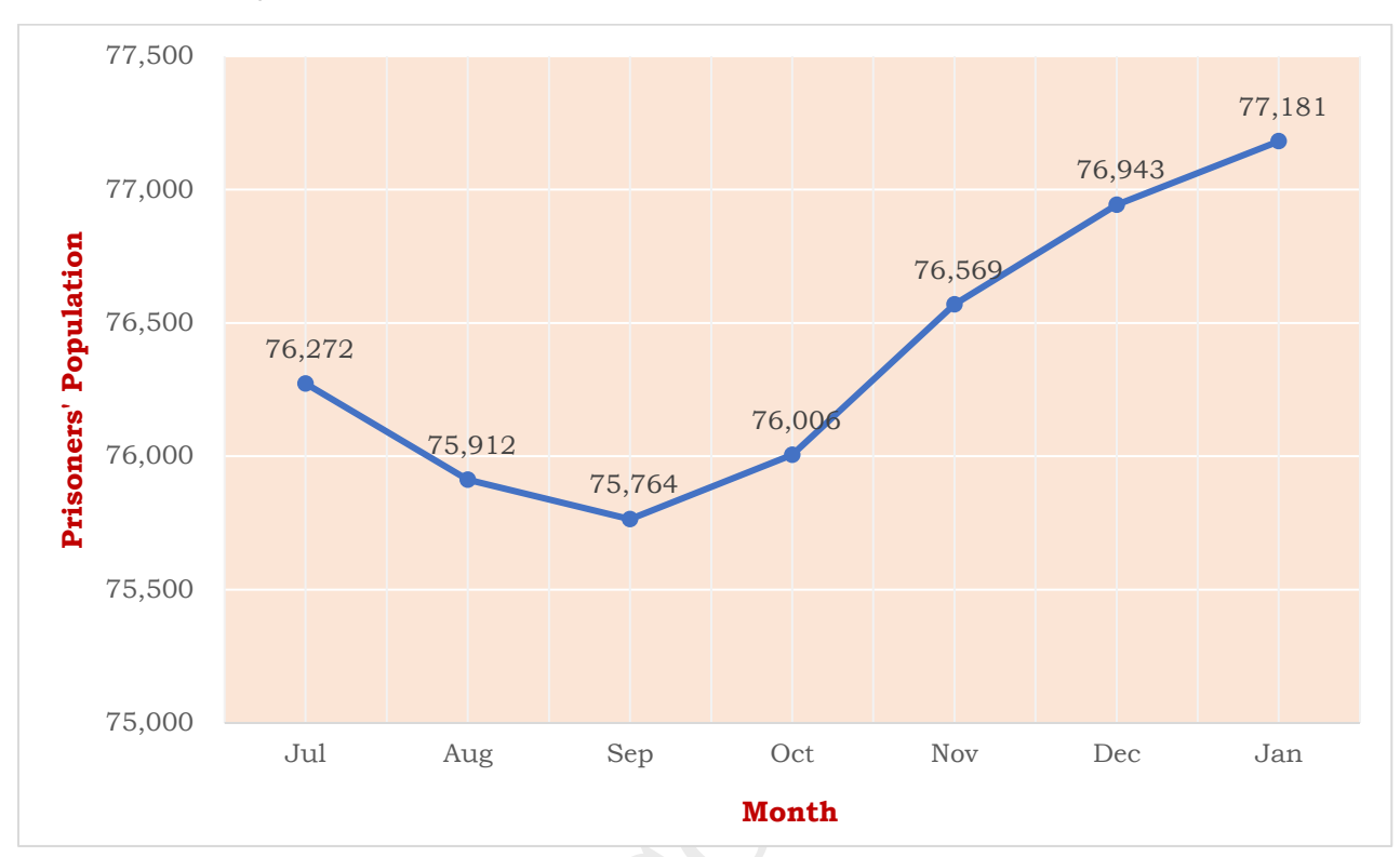
Figure 2: Trend of prisoners' population growth for the period between July, 2023 and January, 2024.