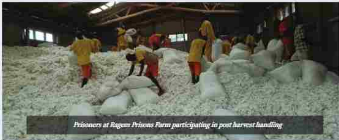
Prisoners at Ragem Prisons Farm participating in post harvest handling.

R agem Prison Farm in Pakwach District isn't just a correctional facility; it's a place where inmates are discovering new skills that promise a fresh start. For inmates, who had never laid their eyes on a cotton plant before, this farm has been transformative.