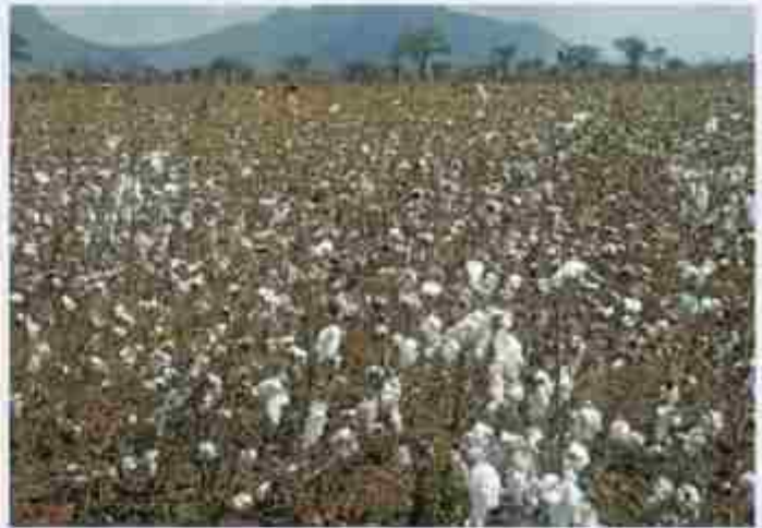
Prisoners picking cotton at Orom Ti-Kau Prisons Farm, Northern Region

T ransitioning from cultivation to the readiness of cotton, the Ug. Prison Farm Orom Ti-Kau stands poised with bales of cotton, a tangible manifestation of the diligent efforts invested in the entire production cycle. The bounty of ready cotton not only symbolizes a successful harvest but also serves as a beacon of hope for the revival of Uganda's textile industry.