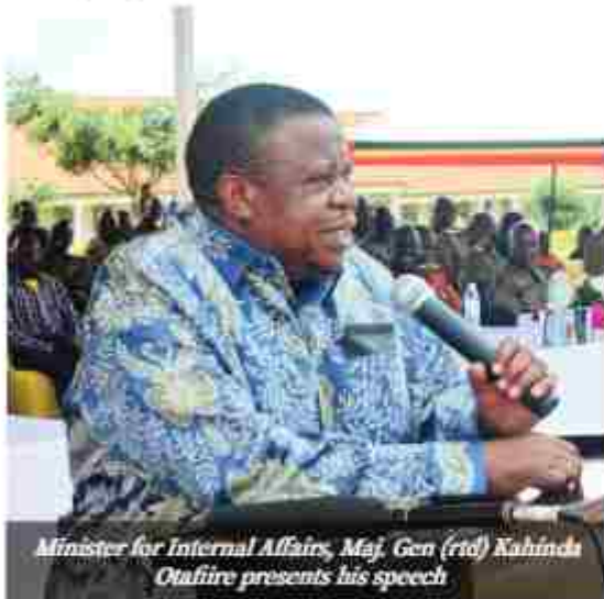
Minister for Internal Affairs, Maj. Gen (ret'd) Kahinda Otafiire presents his speech

Addressing a captivated audience during the inauguration of #InterforcesGames2023, Hon. Kahinda Otafiire highlighted the significance of unity among the forces. He underscored its profound impact on the nation's trajectory, emphasizing that unity stands as a cornerstone for a safer and more secure Uganda. The Minister ceremoniously declared the competitions open, marking the commencement of what promises to be an electrifying series of events.