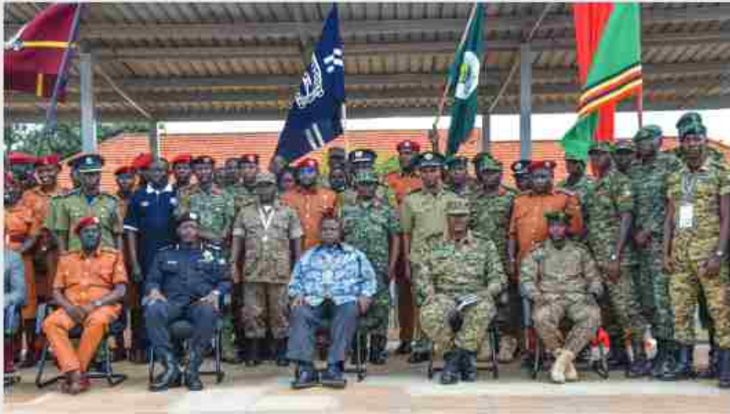
The chief guest, Minister for Internal Affairs, Maj. Gen (ret) Kabinda Otafiro share a photo moment with force officials at the inauguration of the 17th edition of the Uganda Inter-Forces Games and Championships

T he 17th Edition of the Uganda Inter-Forces Games and Championships was a celebration of athletic excellence and collaboration among the country's four armed forces. Hosted by the Uganda Police Force (UPF) at the Police Training School in Kabalye, Masindi district, the games unfolded from November 18th to December 1st, 2023. Under the theme "Fostering Wellness and Inter-Agency Cooperation for a Safe and Secure Uganda," the event aimed to enhance joint operations for sustainable national security, socio-economic transformation and development.