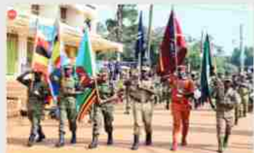
Officers with flags raised marching through Masindi town during the games' opening ceremony

The tournament was supported by 75 officials and technical staff who ensured the smooth running of the competition.