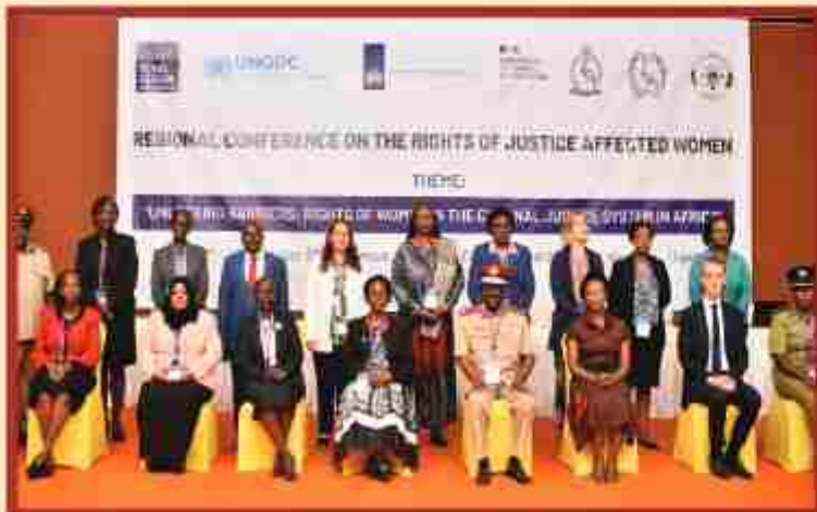
REGIONAL CONFERENCE ON RIGHTS OF JUSTICE AFFECTED WOMEN IN AFRICA, KAMPALA UGANDA 2023