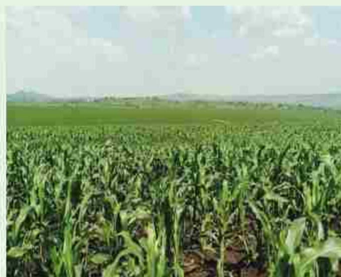
Commercial Maize Production in Butai Prison farm in Northern Uganda

Economic Productivity: SIP IV, aptly named "Productive Correctional Service," is a testament to UPS's commitment to transforming prisoners into responsible, law-abiding, and economically productive citizens. Through initiatives like cotton production, seed processing, livestock rearing, and commercial maize cultivation, UPS has not only contributed to the nation's food security but has also given inmates valuable skills and employment opportunities upon release.