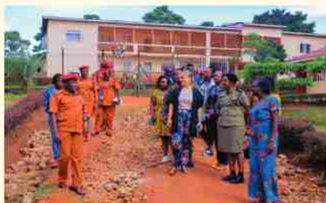
Visitors take on a guided tour around Luzira Women's Prison