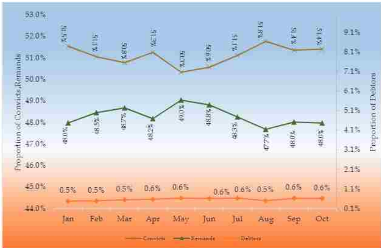
Figure 3: Monthly composition trends of convicts, remands, and debtors