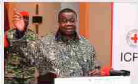
Minister for Internal Affairs, Maj. Gen (rtd) Kahinda Otafiire giving his speech

During the official opening, Uganda's Minister for Internal Affairs, Maj. Gen (rtd) Kahinda Otafiire, highlighted the challenges faced by many prisons in Africa, especially those built during colonial times, which are struggling to accommodate growing populations and competing needs within limited infrastructure budgets. The Minister emphasized the need for governments to take a more proactive role in supporting correctional services. He also highlighted the impact of environments on individuals, reinforcing the need for holistic approaches to break the cycle.