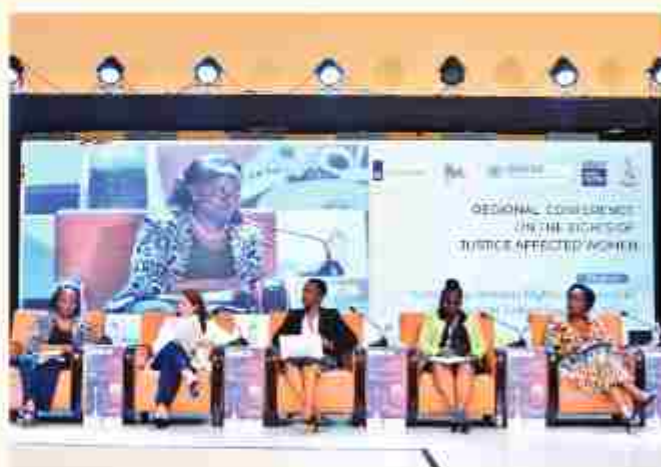
Panelists engage in a discussion at the conference