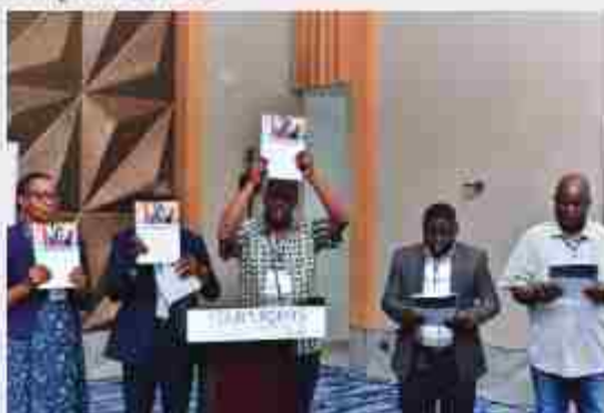
Inauguration of the Prisons Maintenance Guide Manual

He praised the innovative approach of Uganda Prisons' current Commissioner General from meticulous planning and benchmarking global facilities to negotiations with consultants, the journey to Kitalya's creation showcases visionary leadership in action