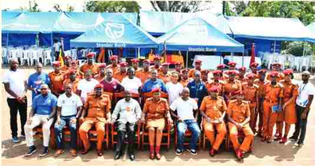
Stanbic bank officials and UPS officers share a photo moment at the event

S tanbic Bank Uganda has unveiled a groundbreaking initiative aimed at enhancing the financial literacy of prison officers and their spouses across the country. The program, launched in collaboration with Uganda Prisons Service, seeks to equip officers with essential financial management skills, empowering them to make informed decisions about their money and ultimately improve their economic well-being.