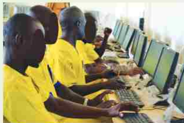
Inmates take on computer lessons

The development of a comprehensive corrections policy and rehabilitation model is vital to ensure the effectiveness and fairness of correctional services. This further aligns with Uganda's commitment to uphold human rights.