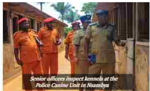
Senior officers inspect kennels at the Police Canine Unit in Nsambya