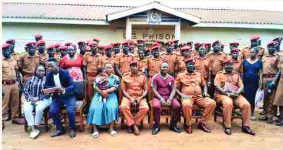
Stanbic bank and UPS Masaka Main prison staff members pose for a photo moment

Stanbic Bank Uganda took a significant step towards fostering economic growth among Southern Region prison staff and their spouses through a financial literacy program held at Masaka Main Prison. The event witnessed active participation from diverse staff members representing all 17 prison units in the region.