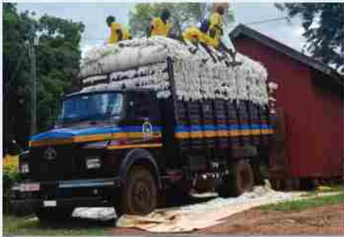
Delivery of cotton to the ginnery, Kaberamaido Prison