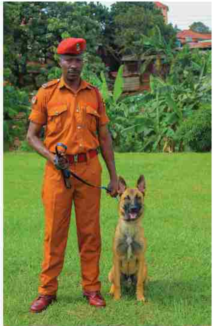
Demo: Standby using dogs on search alert