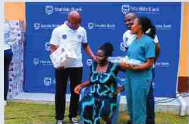
An expectant mother being given some of the gifts

Our donation of Mama Kits, mosquito nets, and surgical tools is a testament to our commitment to contributing to the Sustainable Development Goals (SDGs) that aim to improve the lives of all individuals."