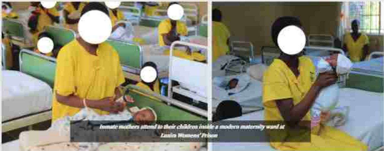
Inmate mothers attend to their children inside a mothers maternity ward at Luzira Womens' Prison

T he provision of comprehensive maternity healthcare becomes paramount in safeguarding the well-being of women within Prisons.