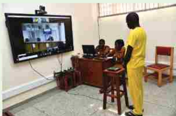
Video teleconferencing project enrolled in all district Main Prisons country wide.

Development in ICT infrastructure, policies, and systems, coupled with the "Production of prisoners to courts," has streamlined legal processes within the correctional system. This enhances access to justice for inmates, a critical component of Vision 2040's goal of a more equitable society.