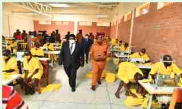
Hon. Kahinda Otalire, Minister for Internal Affairs inspecting tailoring workshop in Kitabya which has engaged in production of uniforms for inmates and staff.

Reviving Prisons Industries: UPS has breathed new life into Prisons Industries, which now supplies furniture to various Ministries, Departments, and Agencies (MDAs), schools, and Local Governments. This not only boosts the local economy but also provides employment to inmates, helping them reintegrate into society as responsible citizens.