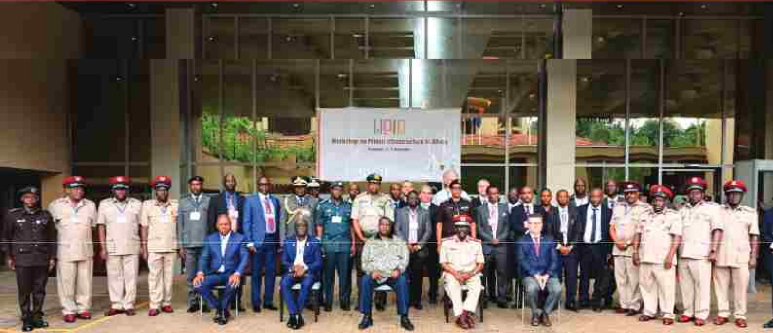
DELEGATES OF PRISONS INFRASTRUCTURE IN AFRICA WORKSHOP GATHER IN KAMPALA, UGANDA