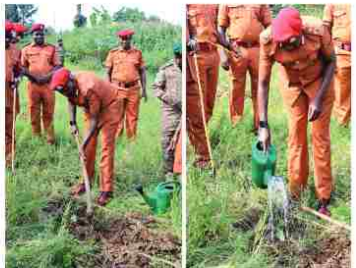
Greening Uganda: UPS Officers participate in the Mahogany tree planting exercise as part of Inter-forces G.Ss activity

The tree planting initiative signifies a proactive approach to combat deforestation, showcasing a collective commitment to combating climate change and fostering sustainability. Beyond the sporting event, the plantation stands as a meaningful legacy, symbolizing the armed forces' dedication not just to athletic prowess but also to the enduring ecological health and vitality of Masindi District and its environs.