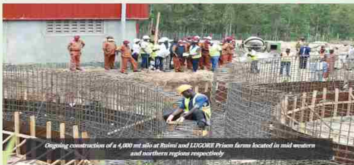
Ongoing construction of a 4,000 mt silo at Butai and LUGORE Prisons farms located in mid western and northern regions respectively

Uganda Prisons Service (UPS) has been a crucial contributor to Uganda's journey towards socio-economic development in alignment with Vision 2040. The UPS vision, "A center of excellence in providing human rights-based correctional services in Africa," has led to a series of Strategic Investment Plans (SIP) that have not only transformed the correctional service but have also become integral to the nation's developmental goals.