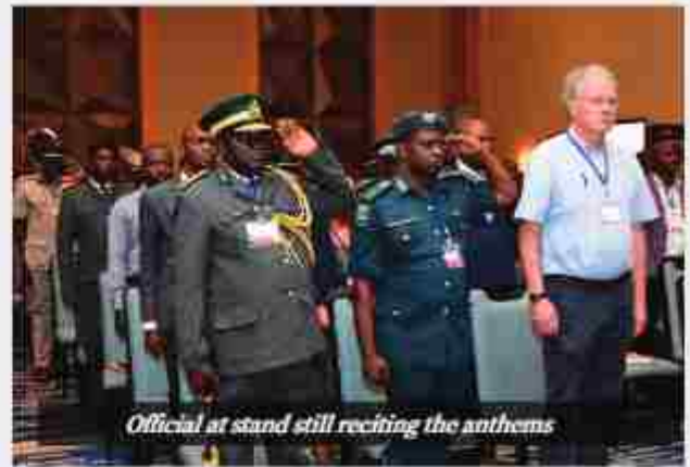
Official at stand still reciting the anthems