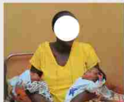
An inmate mother with her twins at Luzira Womens' Prison

Ultimately, the provision of maternal healthcare stands as a symbol of compassion and acknowledgment of the fundamental right to quality healthcare, irrespective of one's circumstances, in the Ugandan context.