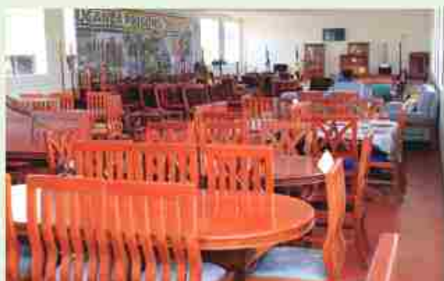
Products of Prisons Industries at the National Agricultural Show