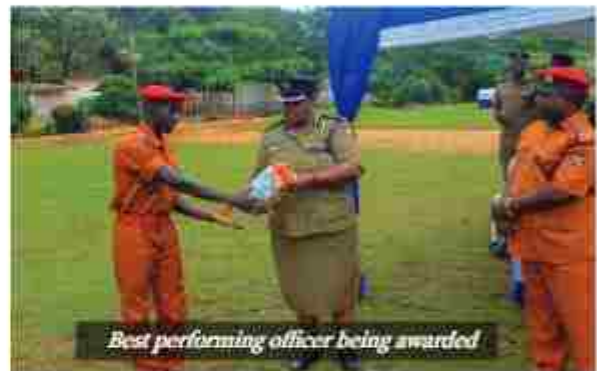
Best performing officer being awarded

In a demonstration of their dedication to strengthening security measures, 33 Uganda Police and 5 Uganda Prisons Officers completed an extensive five-month Basic Dog Handling Training and Care course. The completion of this training signifies a profound commitment to enhancing capacity and effectiveness within law enforcement.