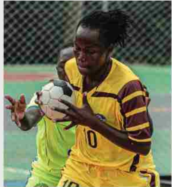
UPS Handball team members