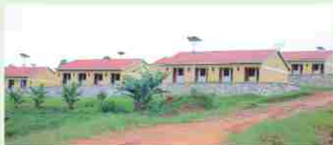
Newly completed Staff Quarters at Ntungamo Prison.

UPS recognizes the importance of staff welfare in delivering quality correctional services. Initiatives to improve staff accommodation, healthcare services, and food security have a direct impact on the well-being of those who play a crucial role in the rehabilitation and reintegration of inmates.