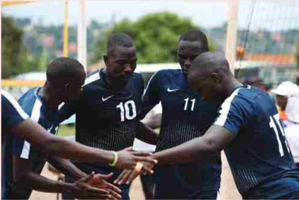
Team work is key! - UPS Volleyball team drums for victory

The Prisons Volleyball Club stands tall, perched at the summit of the Serie B table in Uganda's Volleyball League. Their performance has seen them dominate the league, securing the top position with an outstanding record.