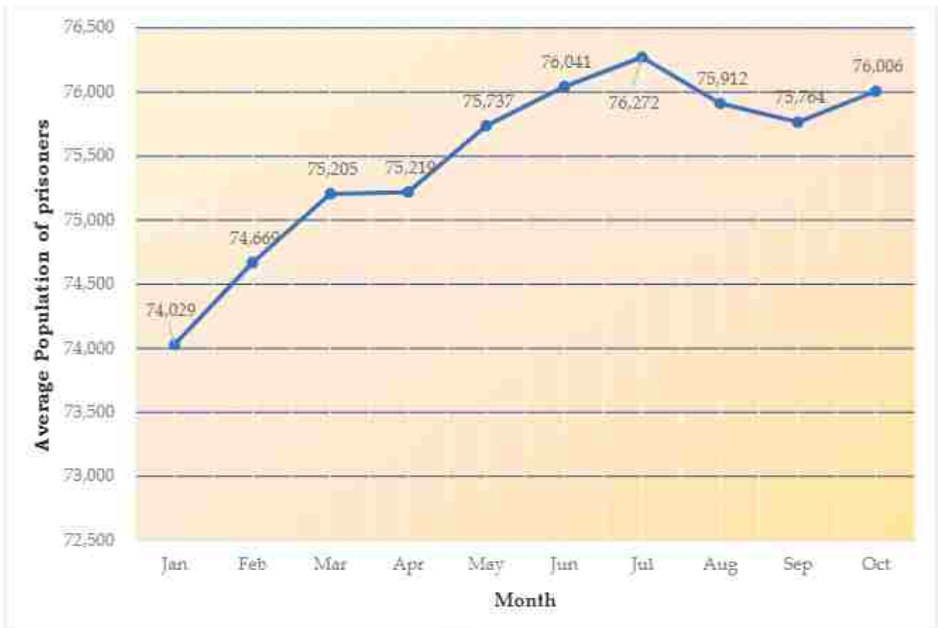
Figure 2: Trend of prisoners' population growth for the period from January to October 2023.