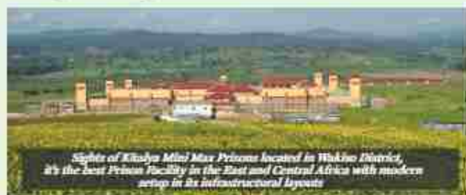
Sights of Kibuka Mitali Max Prisons located in Wakiso District, it's the best Prison facility in the East and Central Africa with modern setup in its infrastructural layout