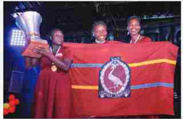
VIVA! UPS: She cranes champions celebrate