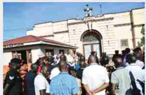
Visiting officials being briefed before embarking on a tour around UG Prisons Upper, Lusira-Kampala