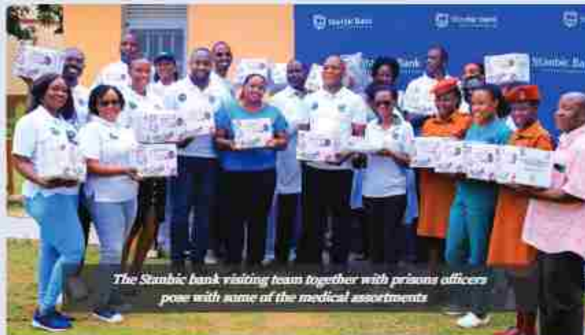
The Stanbic bank visiting teams together with prisons officers pose with some of the medical assortments

Stanbic Bank Uganda extended its support to Uganda Prisons Service by donating a substantial assortment of medical equipment aimed at improving healthcare services for both staff and inmates. The donation, comprising Mama Kits, mosquito nets, and surgical tools, was officially handed over during a ceremony at the Luzira Prisons Health Center IV.