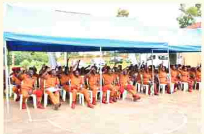
Introduction on horizontal Literacy on going in Lusira

The collaboration between Stanbic Bank Uganda and Uganda Prisons marks a significant step toward empowering officers and their families with crucial financial literacy skills. This initiative reflects a commitment to fostering economic growth and stability within the community, ultimately striving towards a more financially empowered society.