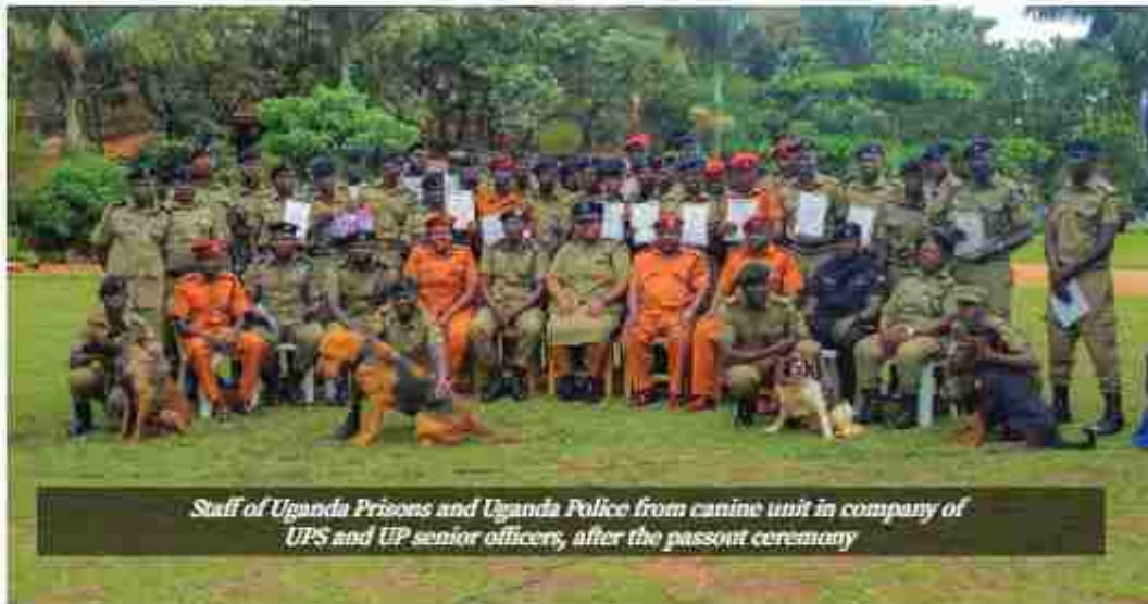
Staff of Uganda Prisons and Uganda Police from canine unit in company of UPS and UP senior officers, after the passout ceremony

In a demonstration of their dedication to strengthening security measures, 33 Uganda Police and 5 Uganda Prisons Officers completed an extensive five-month Basic Dog Handling Training and Care course. The completion of this training signifies a profound commitment to enhancing capacity and effectiveness within law enforcement.