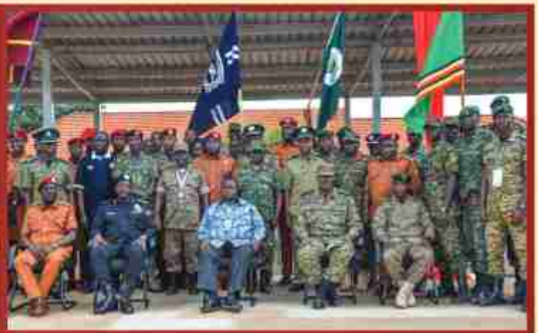
OPENING OF THE 17TH EDITION OF UGANDA INTER-FORCES GAMES, NOVEMBER 2023