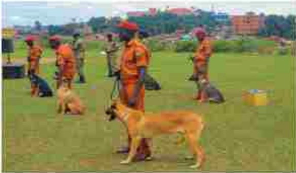
Demo: Parade drills using dogs on the march

Established in 2012, the Uganda Prisons Canine Unit stands as a pivotal pillar of security and safety within correctional facilities. These skilled dogs excel in various roles, from conducting thorough searches and inspections to apprehending escapes and participating in rescue operations. Their expertise in Weapon and Narcotic detection, combined with their exceptional skills in escorts and guard duties, reinforces security measures comprehensively.