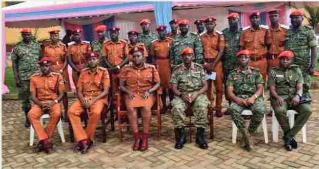
UPS and UPDF senior officers share a photo moment after the Offender Management Training hosted at the Prisons Academy and Training School (PATS)